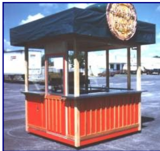
Walk in pizza cart.