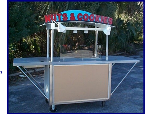
Stainless steel nut & cookie cart with electrical and plumbing

Looking for quality carts? American Metal Products is your answer. From shave ice carts to walk in kiosk carts, we offer a variety of styles and options to customize a cart to your exact specifications. We are proud of our reputation for manufacturing high quality, durable, long lasting stainless steel carts. Our designs focus on operator convenience, ease of maintenance and curb appeal. We currently have several stock model carts that serve as general food service carts. Made of high quality stainless steel, fully welded construction.