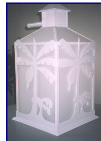
Powder Coated Light Fixture manufactured by AMP

The environmentally safe and economical electrostatic finishing process. Our in house powder coating facility provides durability and impact resistance. Choose from various colors and textures. Give us a call, let us show you why powder coating is the best way to finish up your project.