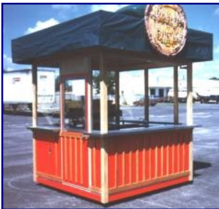
Walk in pizza cart.