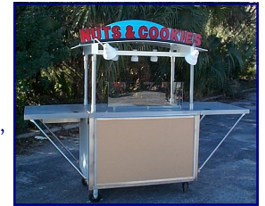
Stainless steel nut & cookie cart with electrical and plumbing

Looking for quality carts? American Metal Products is your answer. From shave ice carts to walk in kiosk carts, we offer a variety of styles and options to customize a cart to your exact specifications. We are proud of our reputation for manufacturing high quality, durable, long lasting stainless steel carts. Our designs focus on operator convenience, ease of maintenance and curb appeal. We currently have several stock model carts that serve as general food service carts. Made of high quality stainless steel, fully welded construction.