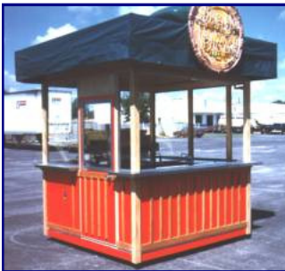
Walk in pizza cart.