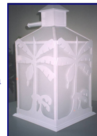
Powder Coated Light Fixture manufactured by AMP

The environmentally safe and economical electrostatic finishing process. Our in house powder coating facility provides durability and impact resistance. Choose from various colors and textures. Give us a call, let us show you why powder coating is the best way to finish up your project.