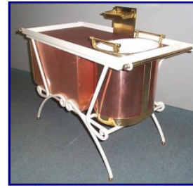
Decorative Brass, Copper and powder coated hammered steel painters table

From prototype to production, we put our quality into every job. Let our engineering team design and provide drawings for any type of project.