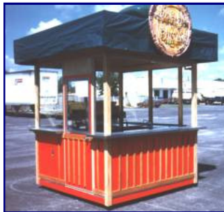
Walk in pizza cart.