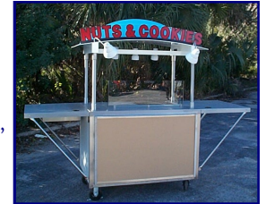
Stainless steel nut & cookie cart with electrical and plumbing

Looking for quality carts? American Metal Products is your answer. From shave ice carts to walk in kiosk carts, we offer a variety of styles and options to customize a cart to your exact specifications. We are proud of our reputation for manufacturing high quality, durable, long lasting stainless steel carts. Our designs focus on operator convenience, ease of maintenance and curb appeal. We currently have several stock model carts that serve as general food service carts. Made of high quality stainless steel, fully welded construction.