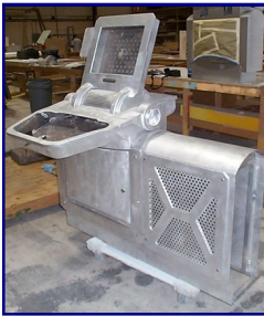
Aluminum Computer Kiosk for Epcot

For over a quarter century, American Metal Products has built a reputation for customized, quality fabricated metal products.