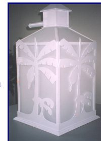
Powder Coated Light Fixture manufactured by AMP

The environmentally safe and economical electrostatic finishing process. Our in house powder coating facility provides durability and impact resistance. Choose from various colors and textures. Give us a call, let us show you why powder coating is the best way to finish up your project.