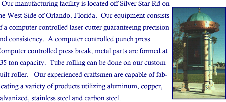
Metal components in this kiosk supplied by AMP

the West Side of Orlando, Florida. Our equipment consists of a computer controlled laser cutter guaranteeing precision and consistency. A computer controlled punch press. Computer controlled press break, metal parts are formed at 135 ton capacity. Tube rolling can be done on our custom built roller. Our experienced craftsmen are capable of fabricating a variety of products utilizing aluminum, copper, galvanized, stainless steel and carbon steel.